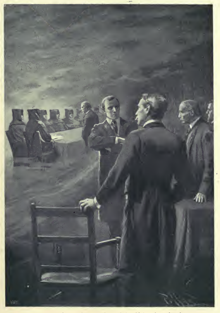
"Presently a picture shaped itself in the cloud."